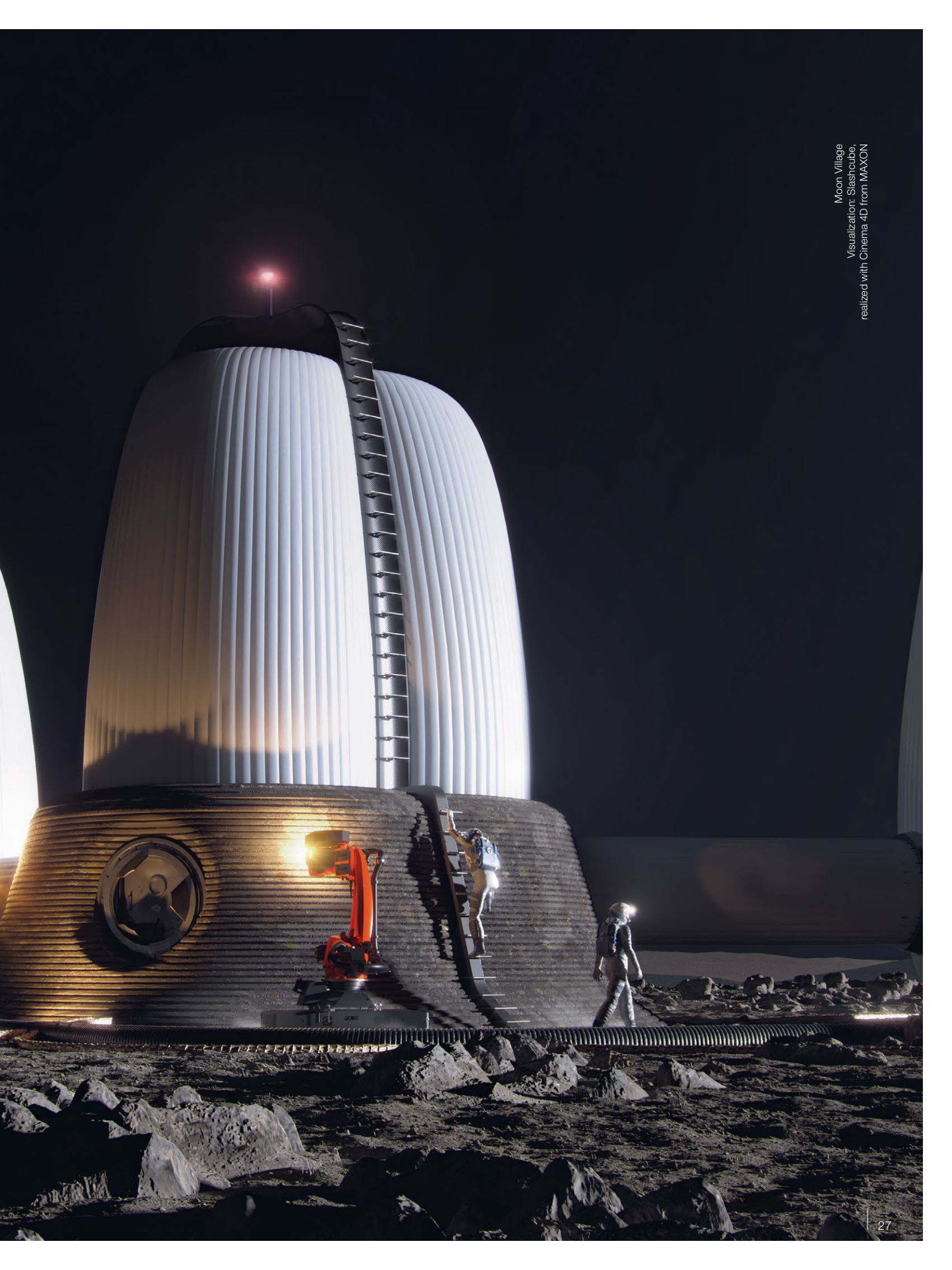
Moon Village Visualization: Slashcube, realized with Cinema 4D from MAXON