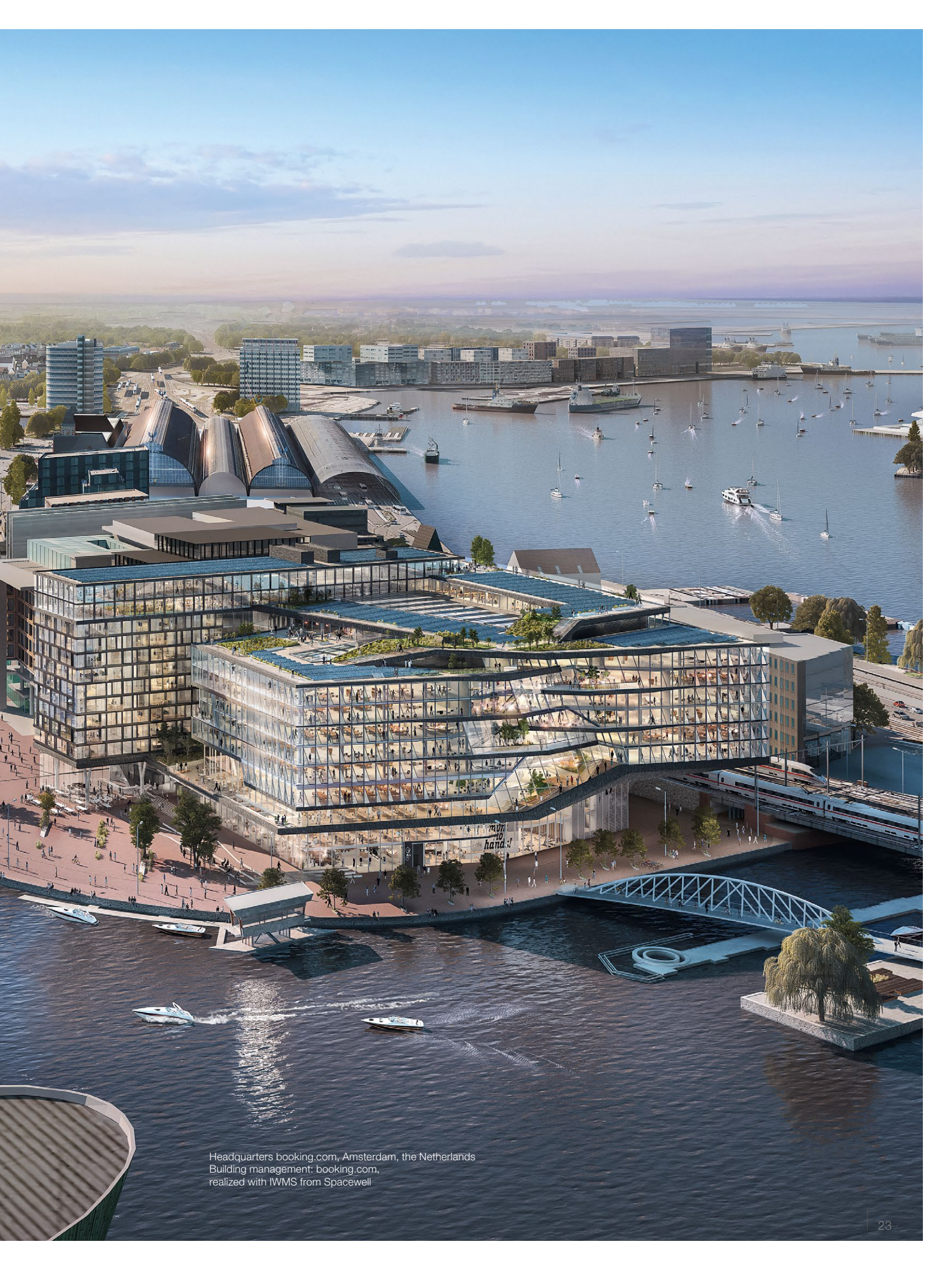
Headquarters booking.com, Amsterdam, the Netherlands Building management: booking.com, realized with IWMS from Spacewell