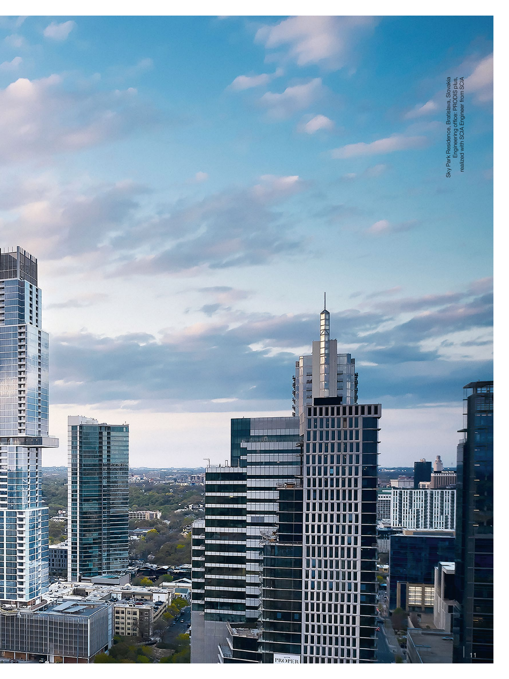
Sky Park Residence, Bratislava, Slovakia Engineering office: PRODIS plus, realized with SCIA Engineer from SCIA